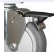
Tech Lock Pedal Brake (H)