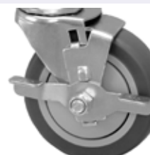
Top Lock Brake (T)