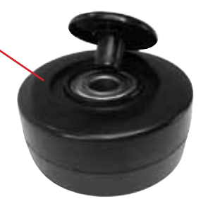
Many other casters and wheels are available; please see Durable Superior Casters® full-line catalog.